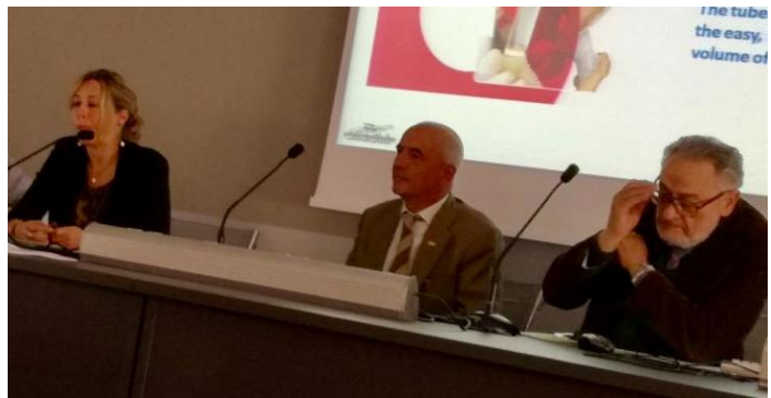
Question and Answer session